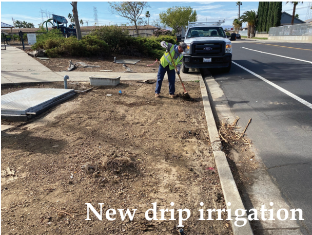
New drip irrigation